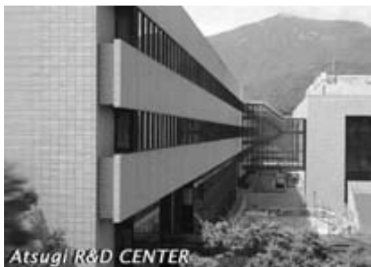
Fig. 1 NTT Atsugi R&D Center